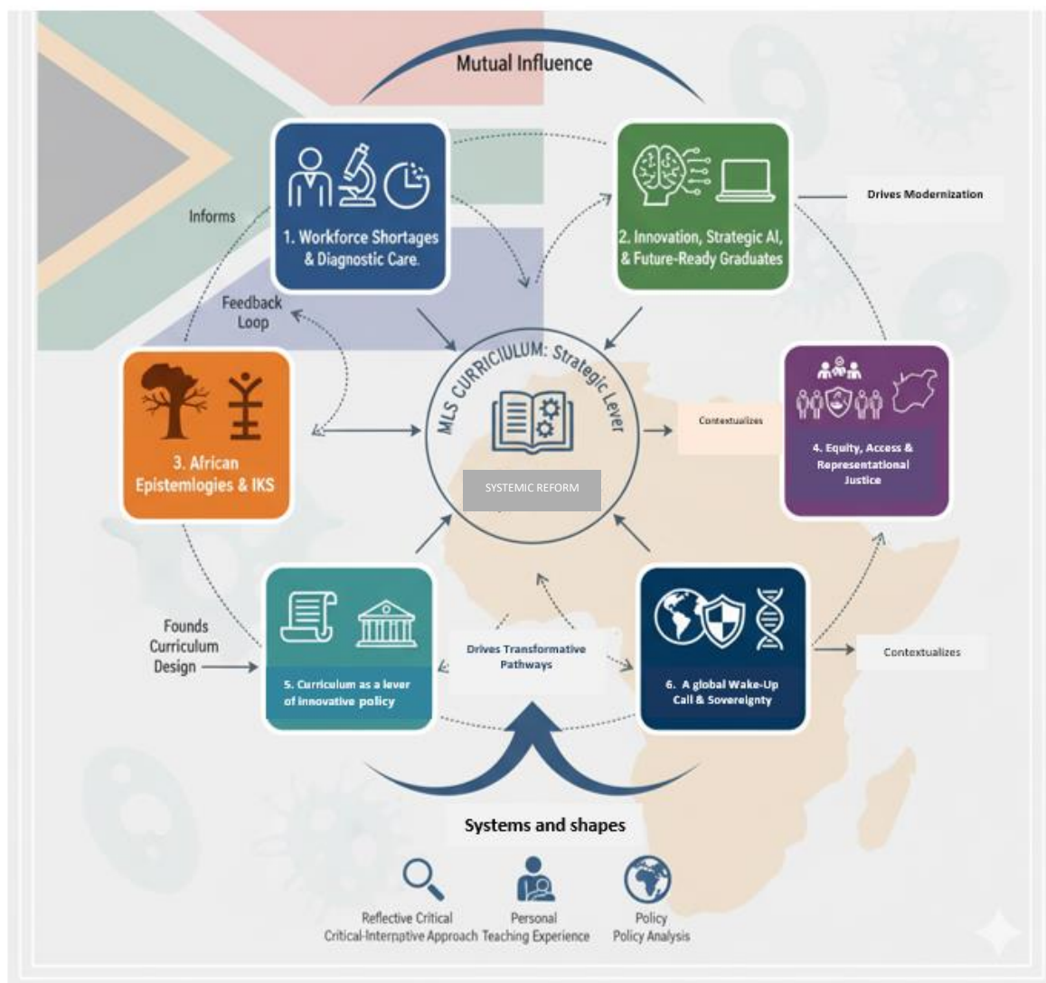
Figure 2: The pillars of the decolonial transformation of MLS education in Africa

Figure 2 shows the themes that emerged from an examination of the above sources. These themes may be seen as the pillars of a transformed Afrocentric MLS curriculum.