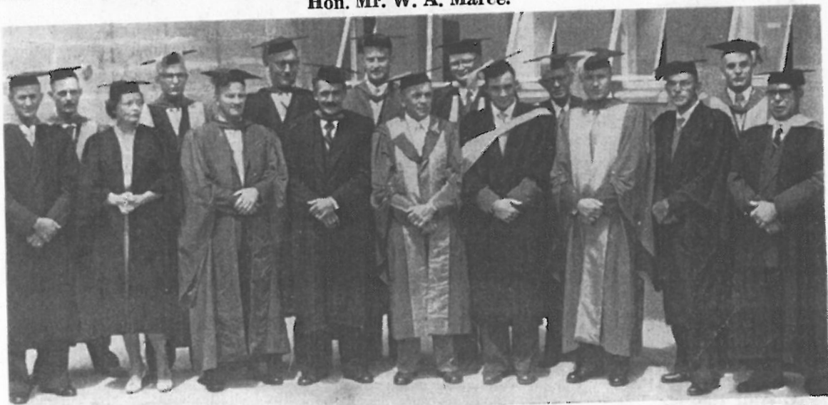
Some of the members of the teaching staff of the University College of the North.