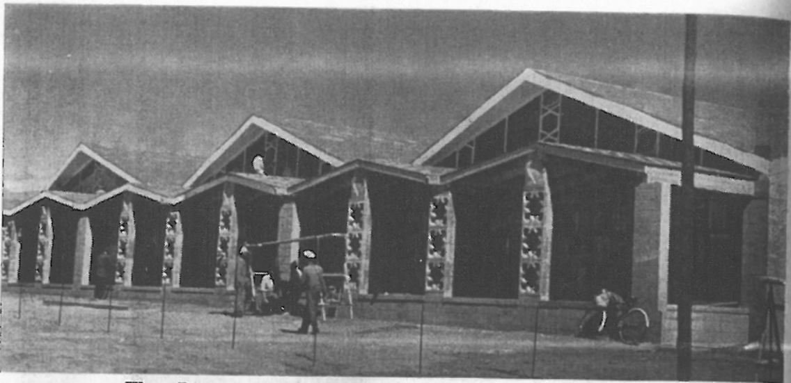
The Dining Hall where the opening ceremony was held.